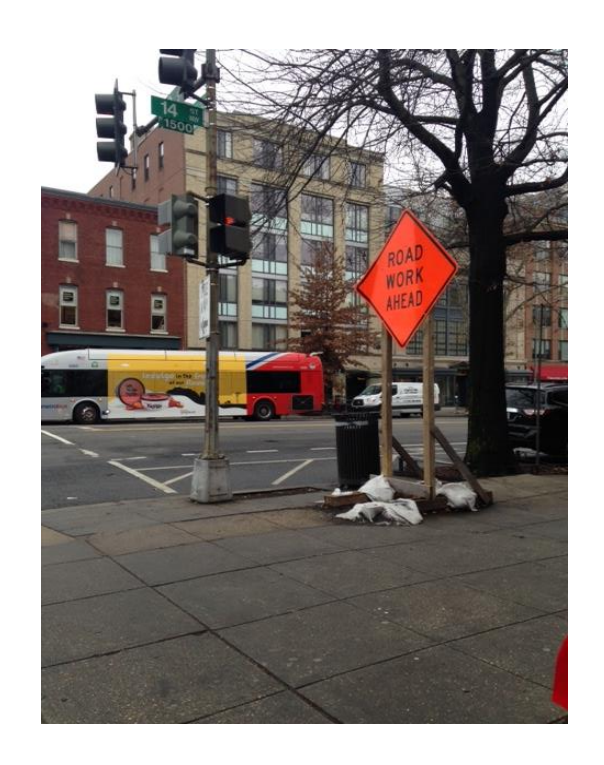
Corner of 14th St. & Q St. NW