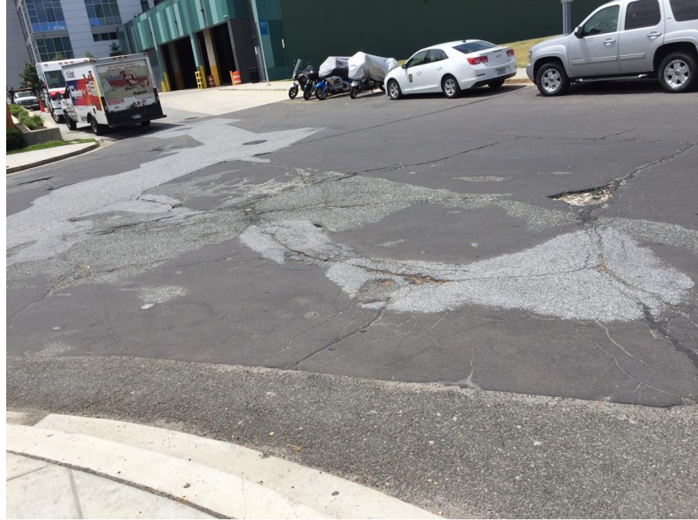
Infrastructure issues: sidewalk & road pavement