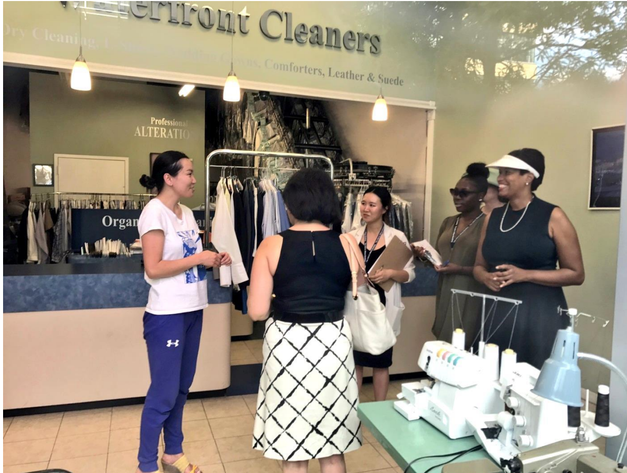
Mayor Bowser engaging with local small business owners in the SW Waterfront area