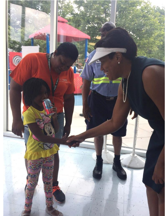
Mayor Bowser engaging youth in the neighborhood