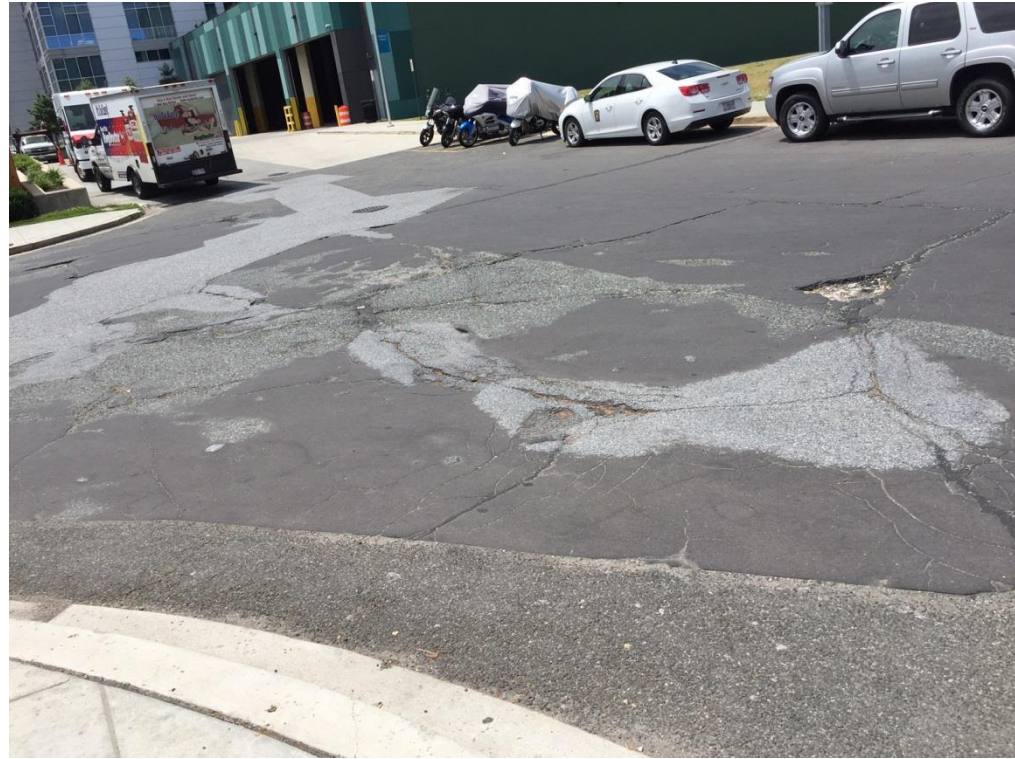
Infrastructure issues: sidewalk & road pavement