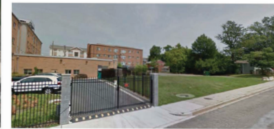
Site, Looking Northeast