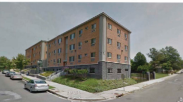
50th Street & D Street, Looking North and East