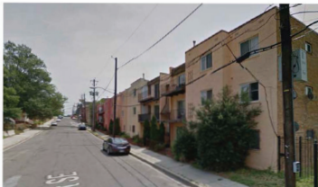
D Street, Looking East (Opposite Site)