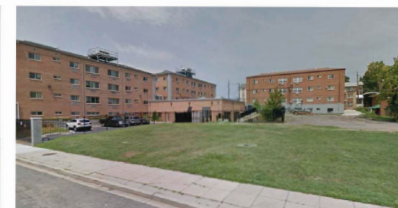
Site, Looking Northwest

For more information, please visit mayor.dc.gov/homewarddc .