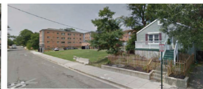
D Street, Looking West to Site